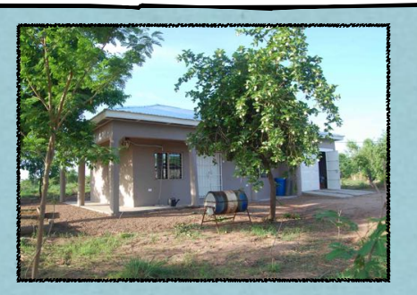
BUIPE BUNGALOW COMPLETE