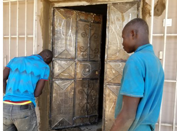
Steel door to improve security.