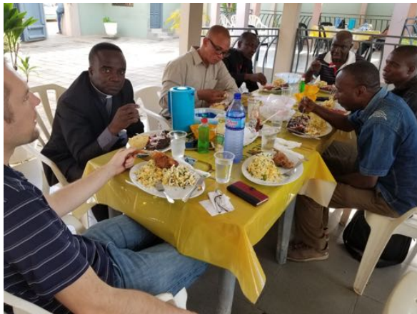
Fellowship meal before the training in Suhum each evening