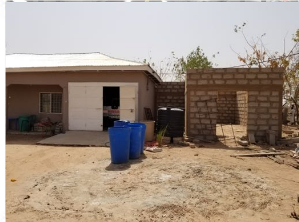
Adding a new room to our house to use for exercising and meetings.

If you haven't done so yet, please check out our website @ https:// ruffupdate.com