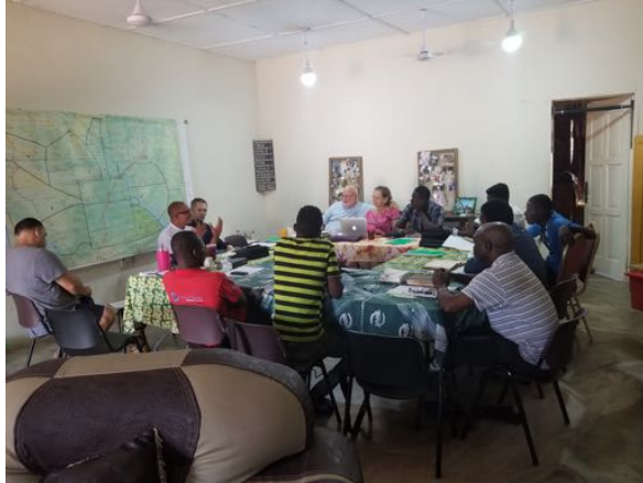
DMM Module 2 Training