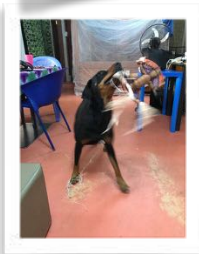
NEW TOY FROM LINDA