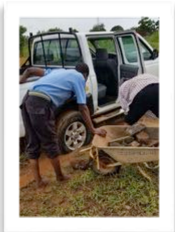
STUCK IN THE MUD