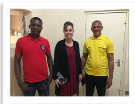
TRAINING IN JOS NIGERIA