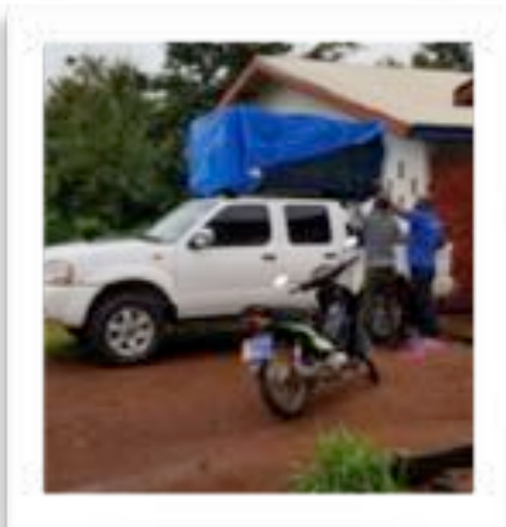
PACKING FOR THE JESUS FILM PROJECT