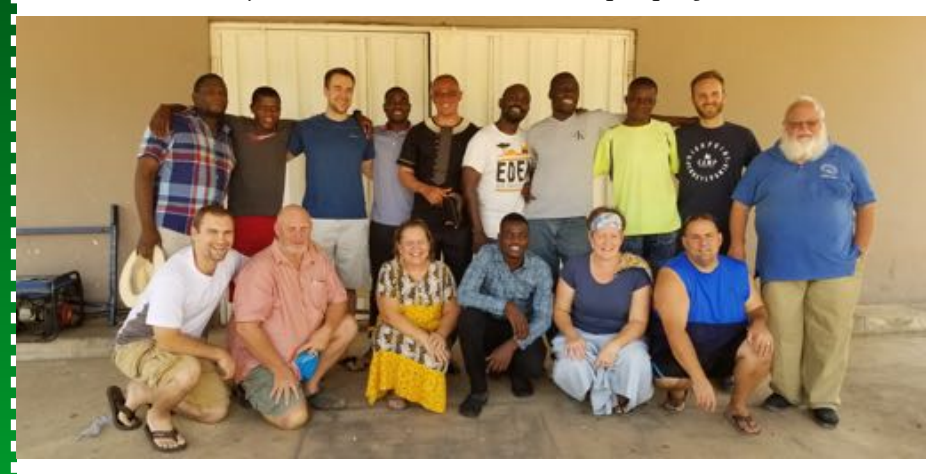
Zimbabwe Team for DMM Training

Pathway Team from Kansas - multiple projects