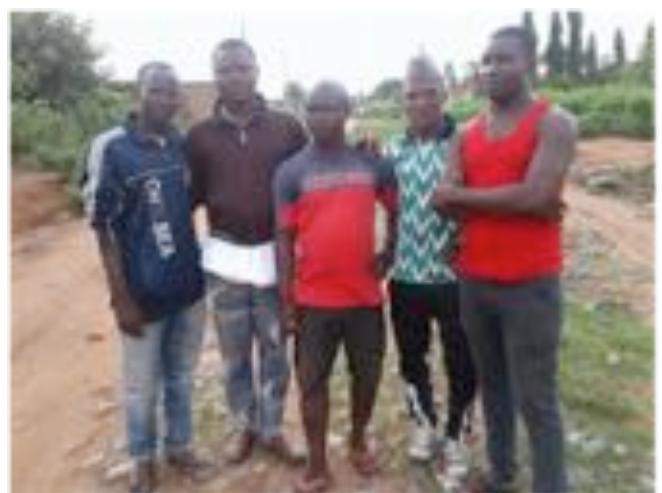
New Discipleship Team in Paraku, Benin