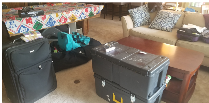
Packed and Ready