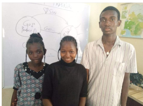
Prayers are needed for these young people. Their father took a decision to return to Islam, but they and their mother decided to continue their faith in Christ. The children have run to the home of the DMM leader in Nigeria. They fear danger will come upon them. Pray for their safety and the safety of the DMM'er and his family. Pray for wisdom.