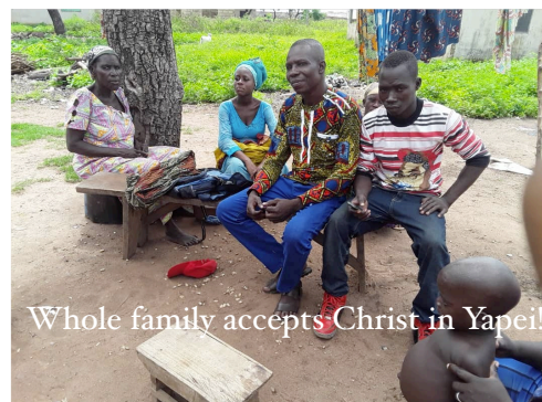
Whole family accepts Christ in Yapei!