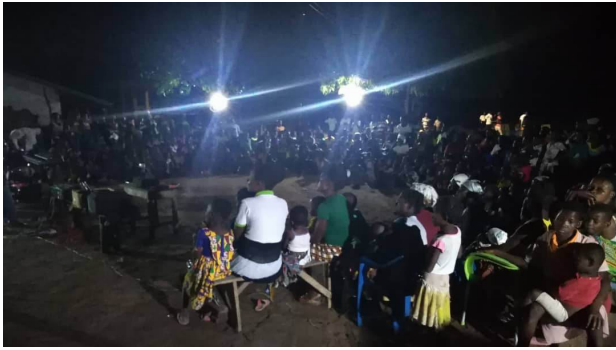
Medical care, and sharing the gospel